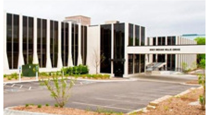
South Side of Building