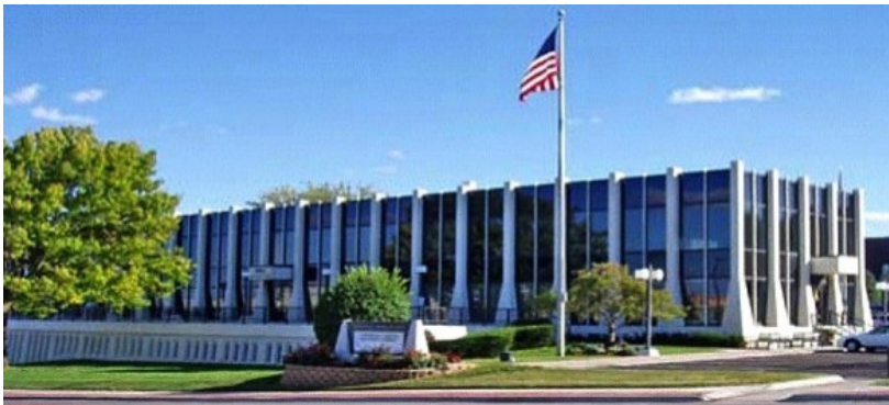
North Side of Building